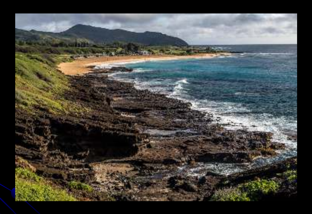
Dan Eberwein Maui Lava Coastline 2<sup>nd</sup> Place, SILVER 87.3 points