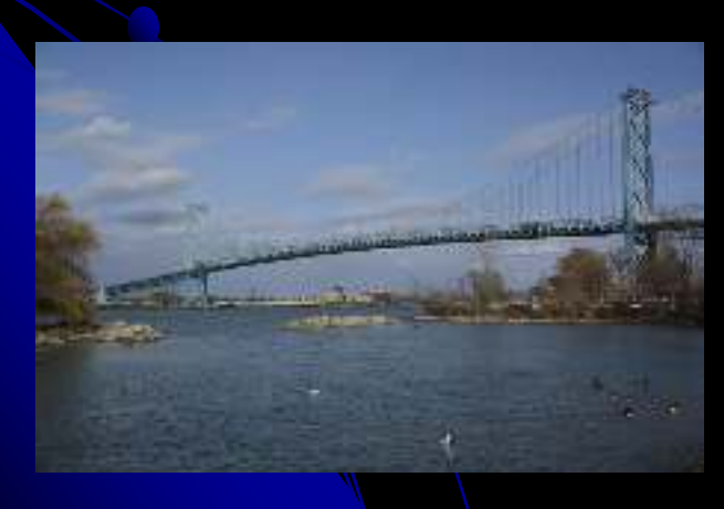
Angelo Tiseo Our Bridge 1st Place, BRONZE 80.7 points