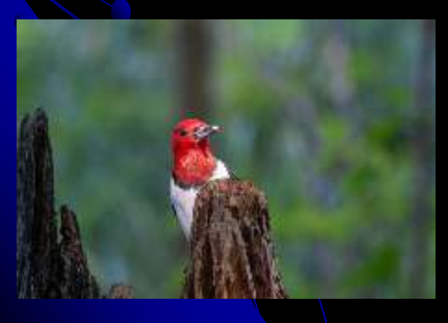
Susan Green Red-headed Woodpecker 1st Place, BRONZE 80.0 points