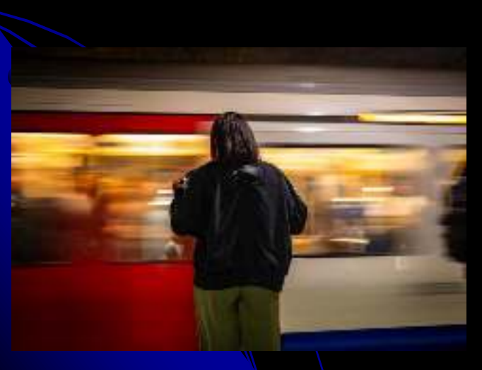
Susan Green Commuter – London Tube 2<sup>nd</sup> Place, BRONZE 75.7 points