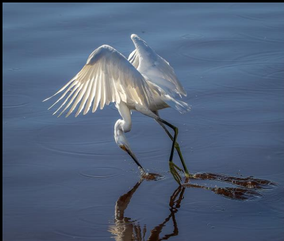
Charles Wilson Snowy Egret Fishing #3 1 st Place, GOLD 90.0 points