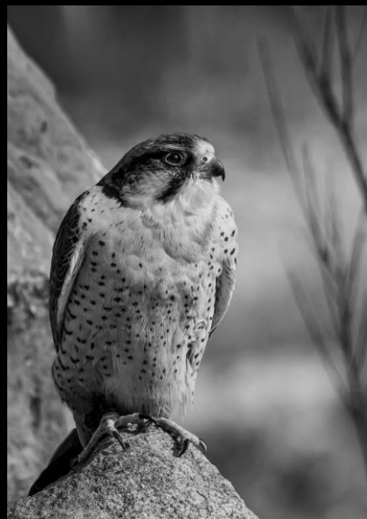
Caroline Tanchioni Peregrine Falcon 1 st Place, SILVER 85.0 points