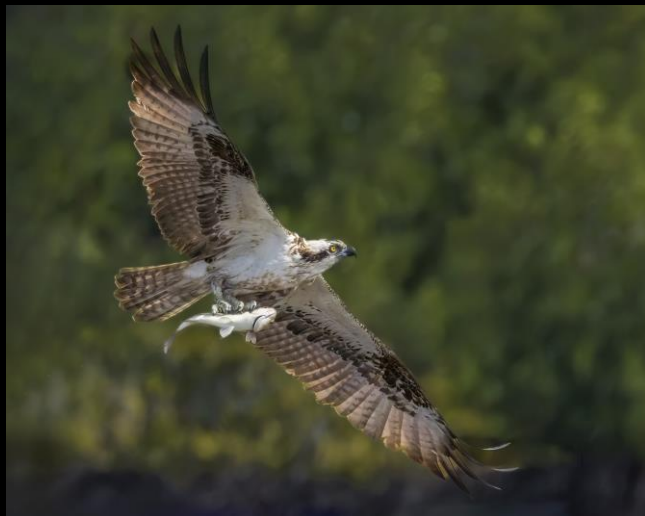
Doug Myers Osprey with Catch 1 st Place, GOLD 85.7 points