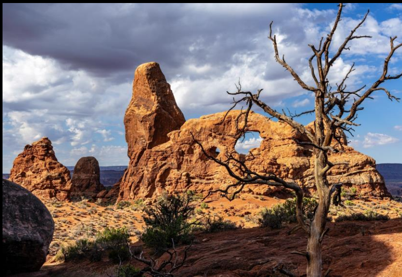
Alan Defoe Turret Arch Thru Tree 1 st Place, GOLD 86.7 points