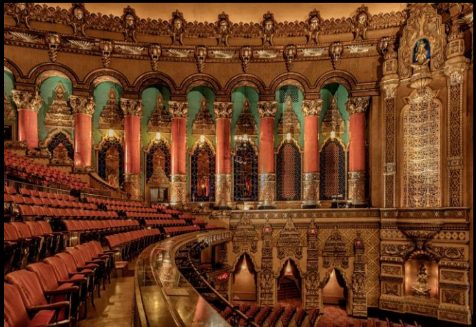
Sherry Butts Fox Theatre 3 rd Place, SILVER 82.3 points