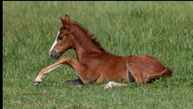
Margit Lanoue Getting Up 1 st Place, SILVER 86.5 points