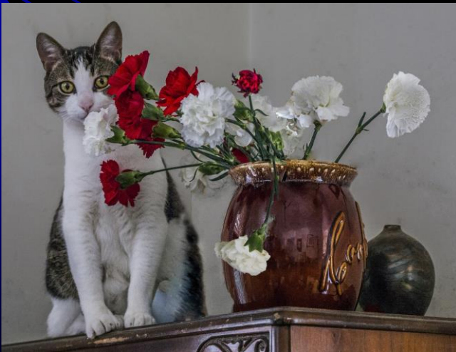
Brian Cowan It Wasn't Me! 1 st Place, BRONZE 76.3 points