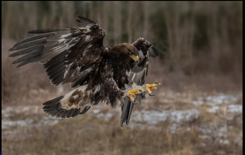
Brent Groh Pouncing Golden Eagle 2 nd Place, GOLD 84.7 points