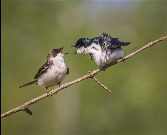
Doug Myers Tree Swallow Dispute 2 nd Place, GOLD 84.7 points