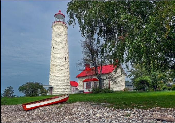
Larry Zavitz Point Clark Lighthouse 2 nd Place, GOLD 87.0 points