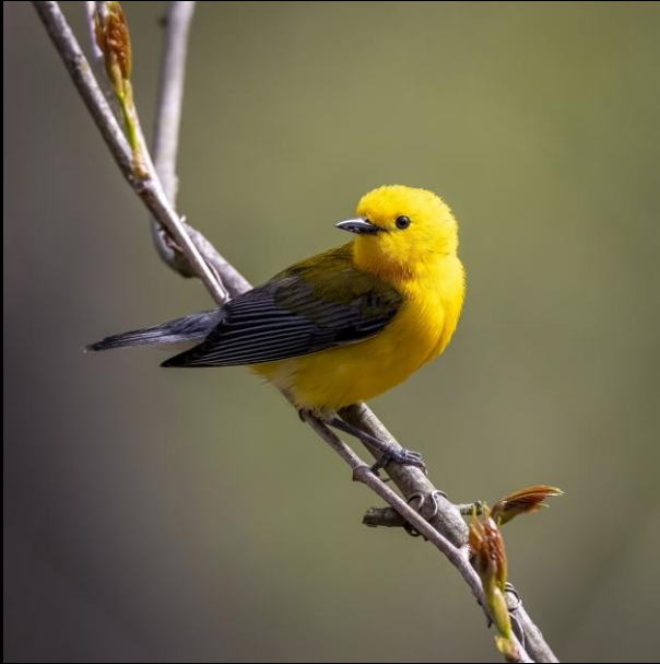
Doug Myers Prothonotary Warbler 1 2 nd Place, GOLD 87.3 points