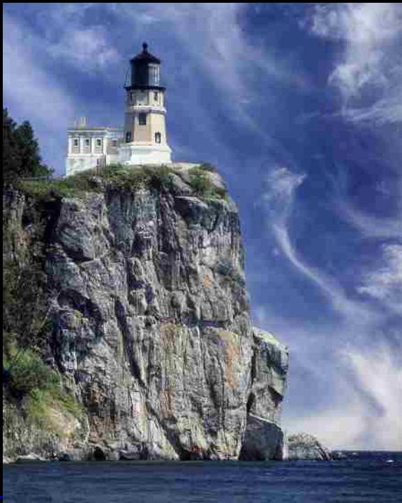
Willy VanAudenaerde Split Rock Lighthouse 1 st Place, GOLD 86.0 points