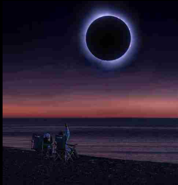
Linda Menard-Watt The Total Eclipse 1 st place, SILVER 86.5 points