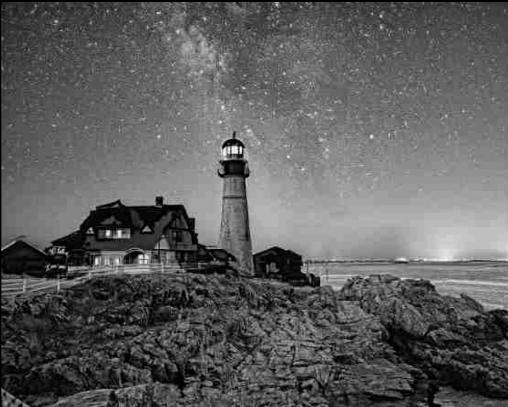
Willy VanAudenaerde Lighthouse at Night 1 st Place, GOLD 83.7 points