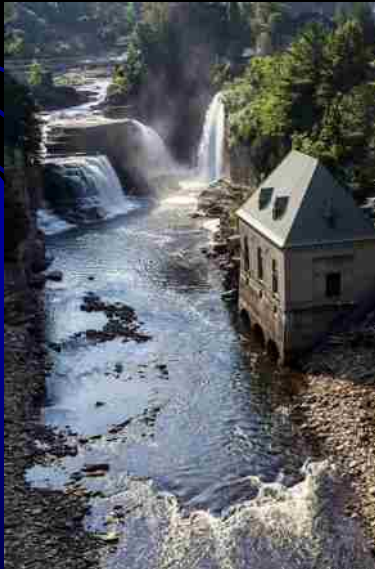
Brian Cowan Ausable Gorge 1 st Place, BRONZE 81.8 points