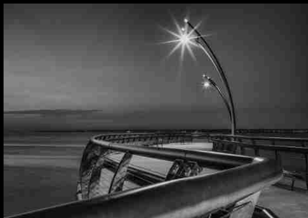
Sherry Butts Brant Street Pier 1 st Place, SILVER 83.0 points