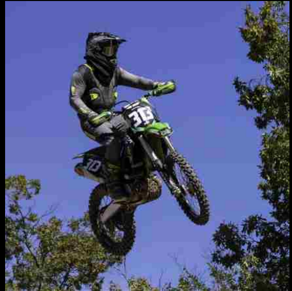
Palmer Johnson Racer 313 1 st Place, SILVER 86.3 points