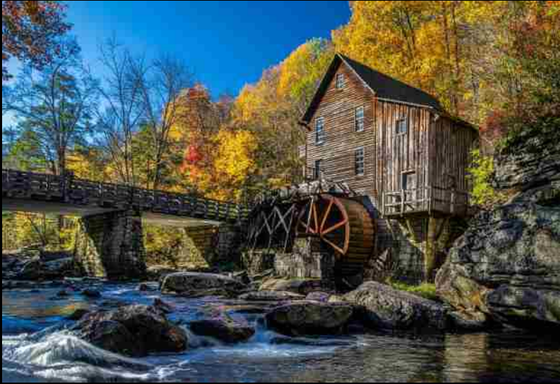
Alan Defoe Grist Mill in Fall 2 nd Place, GOLD 85.3 points