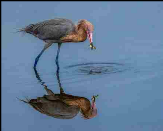
Alan Defoe Reddish Egret with Prey 1 st Place, GOLD 88.0 points