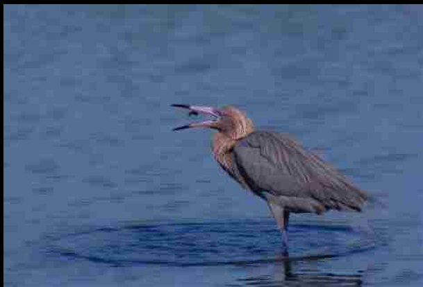
Theresa Tessier Reddish Egret Feasting 1 st Place, GOLD 90.3 points