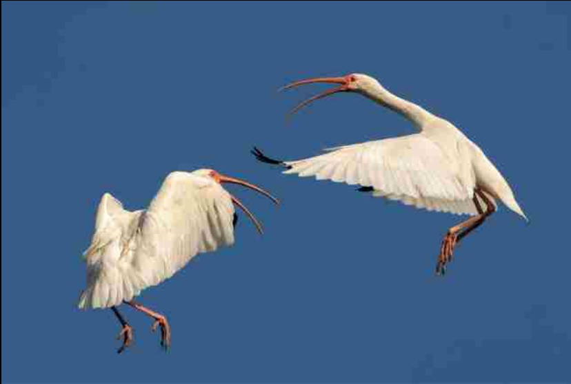
Alan Defoe White Ibis Rivalry 2 nd Place, GOLD 89.0 points