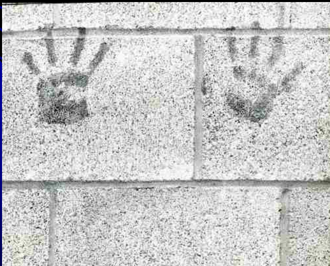
Brian Cowan Pushback 1 st Place, BRONZE 73.7 points