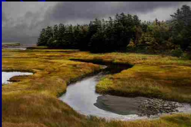
Brian Cowan Wandering To The Sea 1 st Place, BRONZE 75.3 points