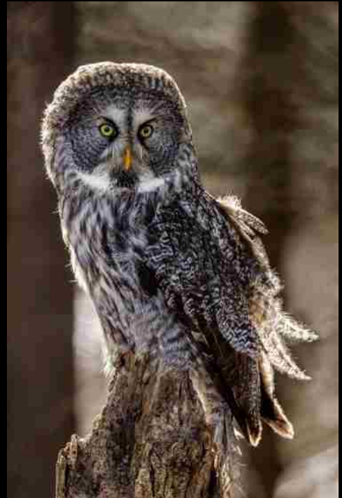
Caroline Tanchioni Great Gray Owl 2 nd Place, SILVER 85.0 points