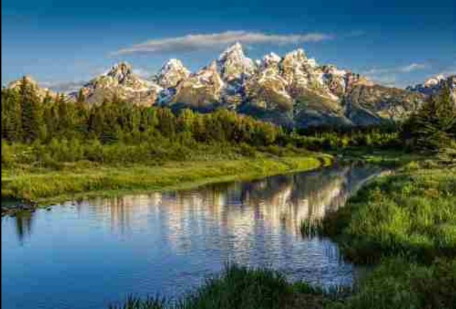
Alan Defoe Teton Mtns at Snake River 1 st Place, GOLD 88.3 points