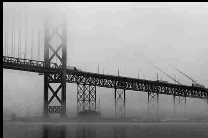
Arlene Kochaniec Foggy Morning Crossing 1 st Place, SILVER 88.0 points