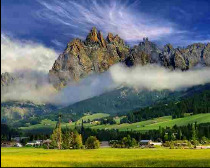
Willy VanAudenaer Early Morning 1 st Place, GOLD 90.3 points