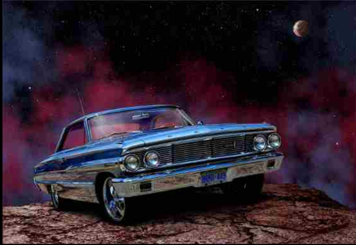
Brian Masters Galaxie 500 1 st Place, GOLD 89.3 points