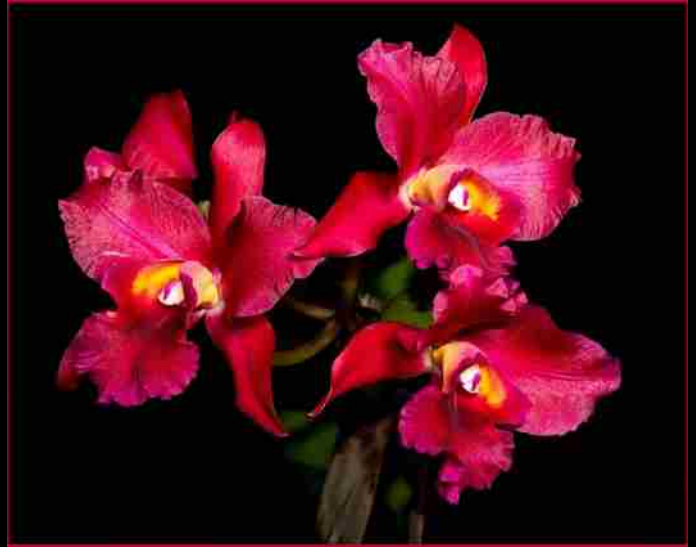
Palmer Johnson Red Ladies 3 rd Place, Silver 83.0 points