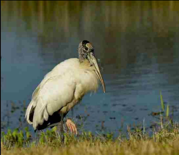
Darlene Beaudet Woodstork (1) 2 nd Place, Silver 85.0 points