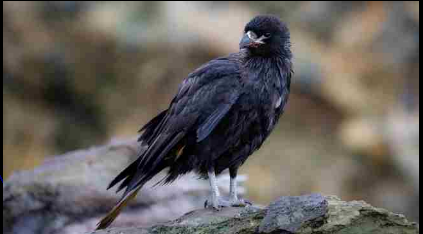
Claude Gauthier Caracara Falklands 2 nd Place, SILVER 85.0 points