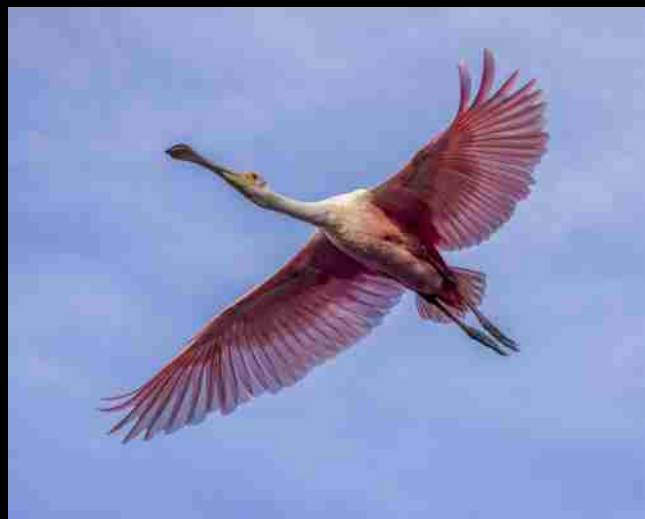
Doug Myers Spoonbill In Flight 1 st Place, Gold 90.7points