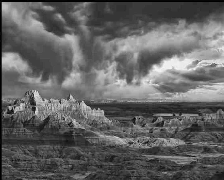
Willy VanAudenaer Stormy Day 1 st Place, GOLD 90.3 points