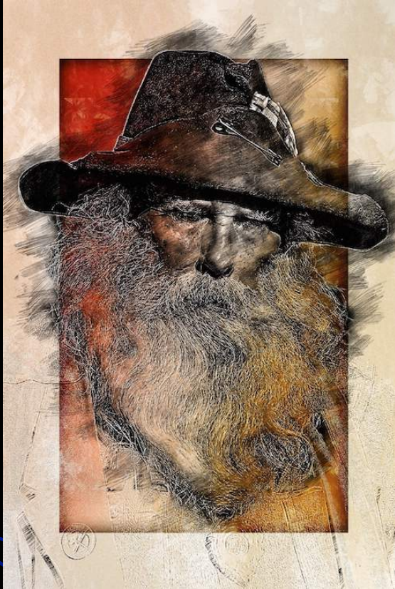
Les Menard Arizona 2 nd place Advanced 90 points