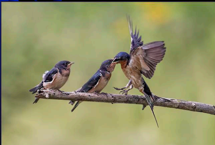
Norm Rheaume Barn Swallow Speed Feed 3rd place Advanced 86.3 points