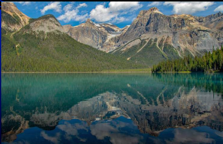
Theresa Tessier Emerald Lake Reflections 3 rd place Advanced 87.7 points