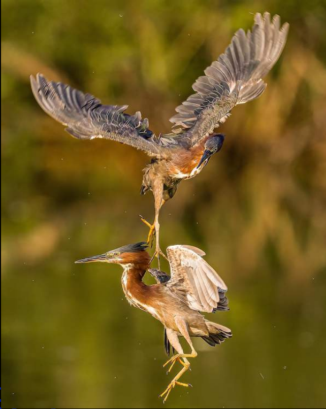
Green Herons 3 rd place Advanced 92 points