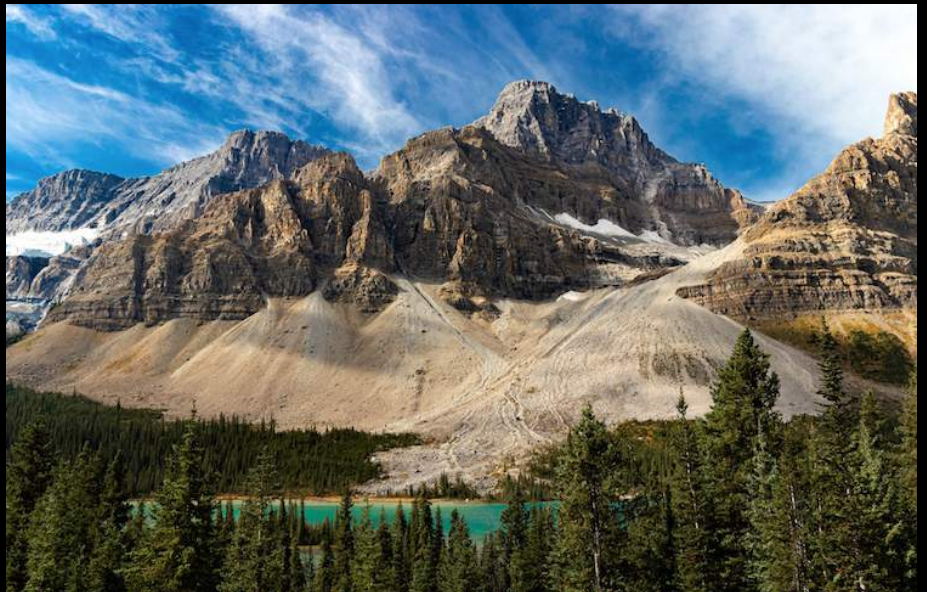
Mt. Thompson 3 rd place Advanced 85.3 points