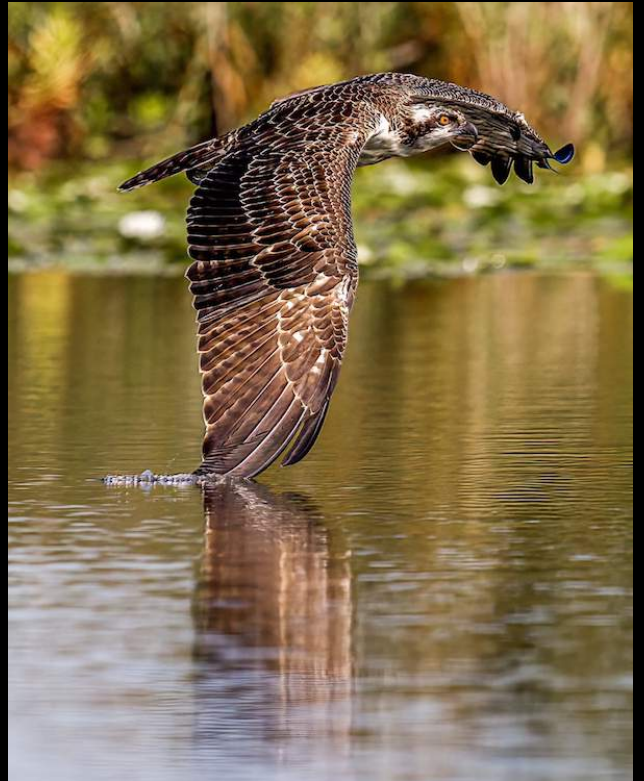
Osprey Gliding 3 rd place Advanced 90 points