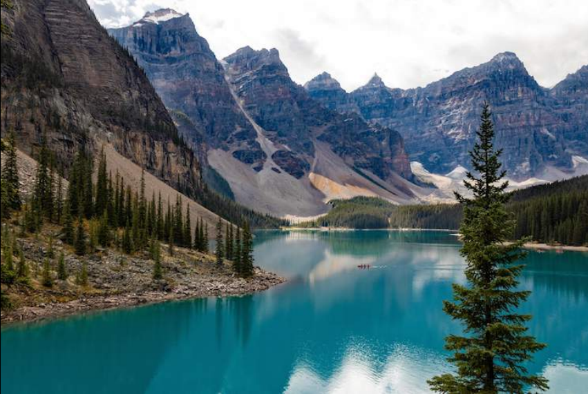
Moraine Lake 3 rd place Advanced 86 points