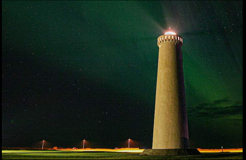
Claude Gauthier Lighthouse Northern Lights 1 st place Advanced 91.7 points