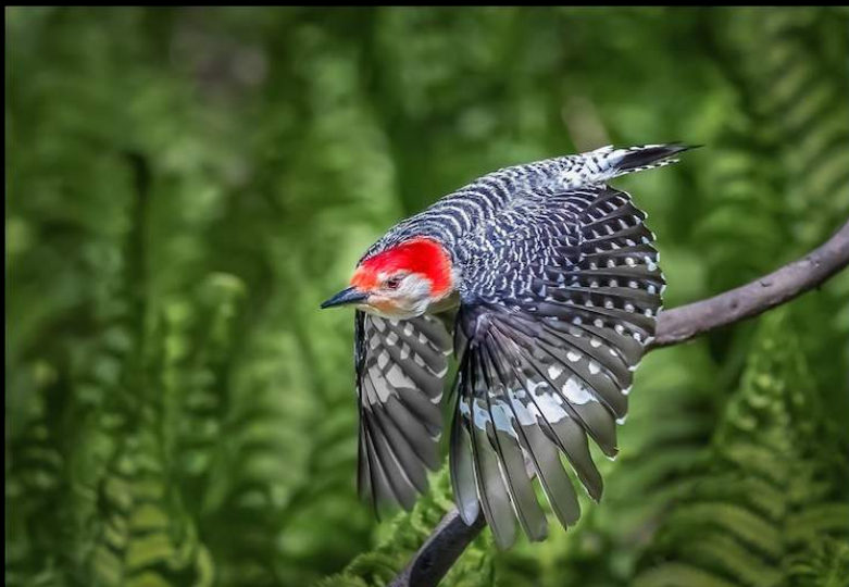
Doug Myers Woodpecker in Flight 1 st place Advanced 92.7 points