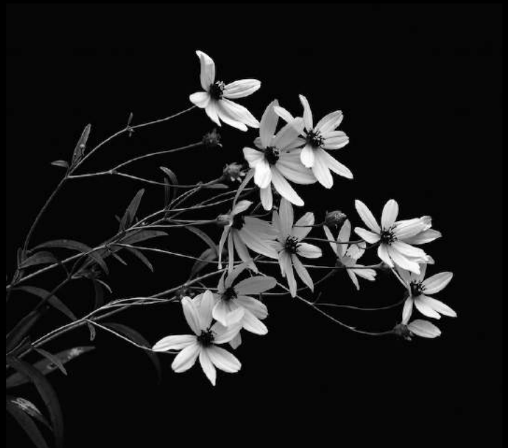
Darlene Beaudet Tickseed in B&W 3 rd place Advanced 82.7 points