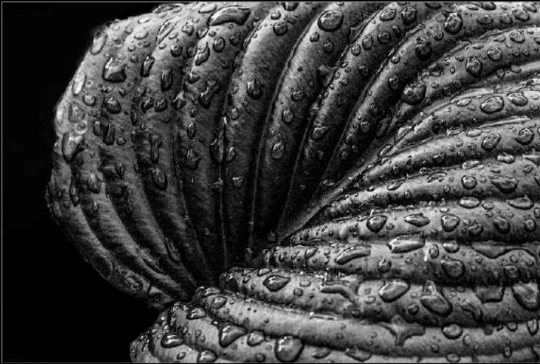
Norm Rheaume Tropical Leaf Plant 2 nd place Advanced 83.5 points