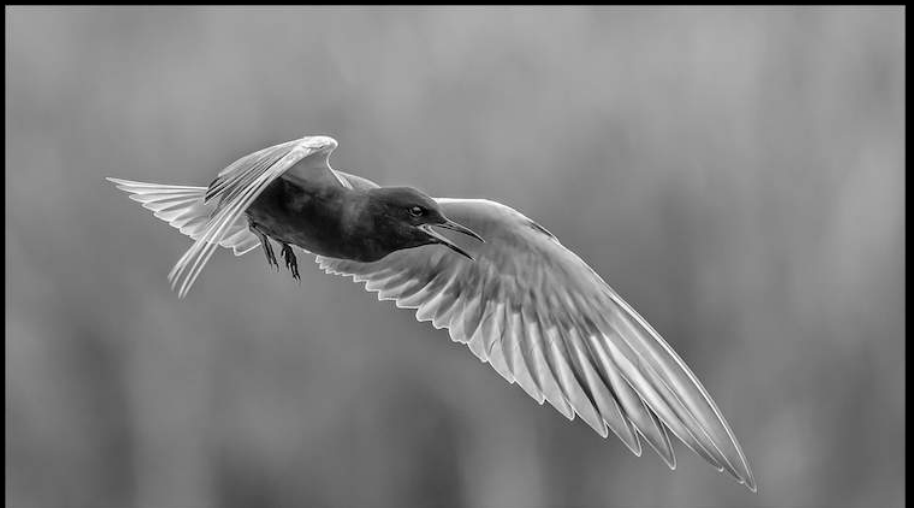
Doug Myers Black Tern 3 rd place Advanced 90.3 points