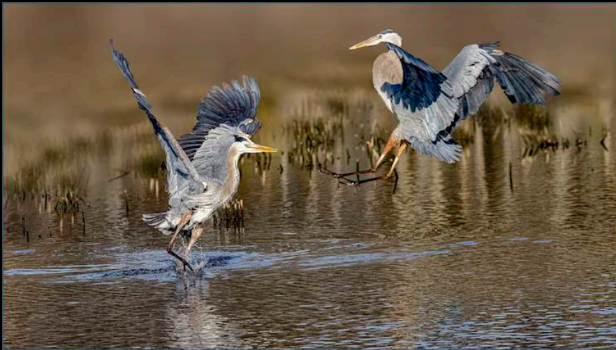
Norm Rheaume Great Blue Heron Rivalry 2 nd place Advanced 92.5 points