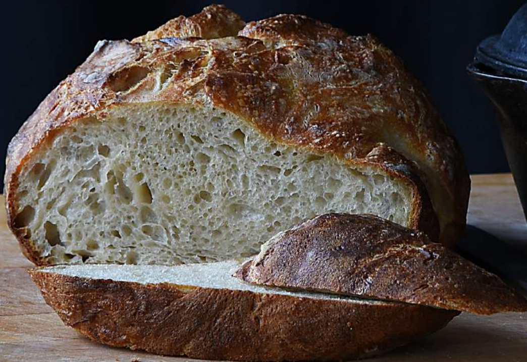
Les Menard Sourdough Bread 1 st place Advanced 86.3 points