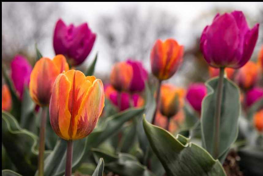
Spring Tulips 1 st place Novice 81 points