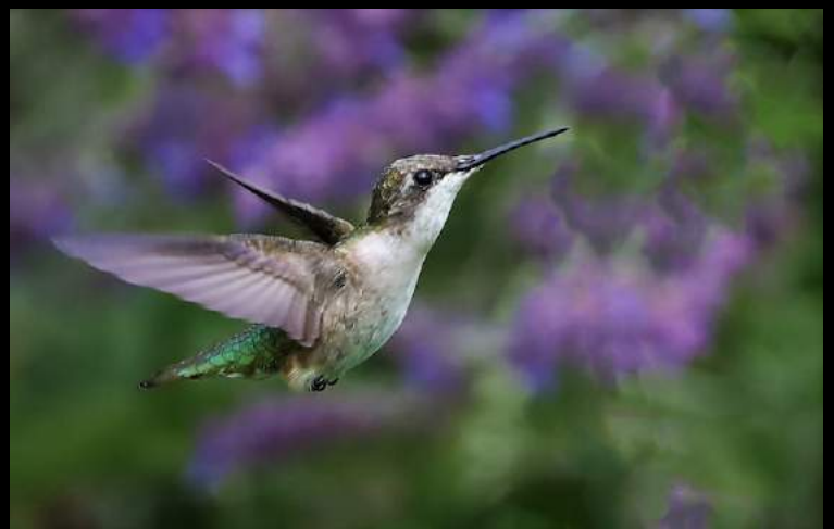
Arlene Kochaniec Female Hummingbird 2 3 rd place Advanced 82.7 points